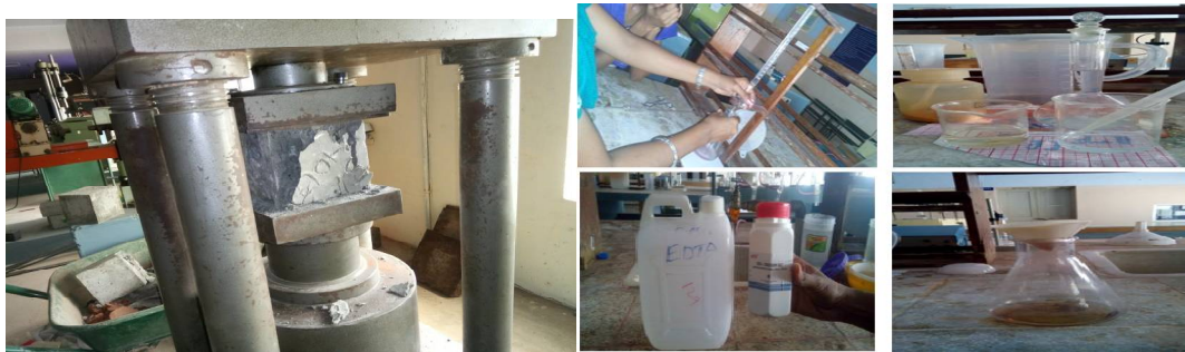
(a) (b) Fig.2 (a) compressive strength test (b) Titration Method

The experimental investigation consisted by varying percentage of eggshell powder as partially replaced with ordinary Portland cement 43 grade. The percentage of eggshell was varied by 5% , 10% , 15% , and 20%. The concrete cubes of 150 X 150 X 150 mm cubes was tested. The compressive strength of 7days and 28days strength was determined.