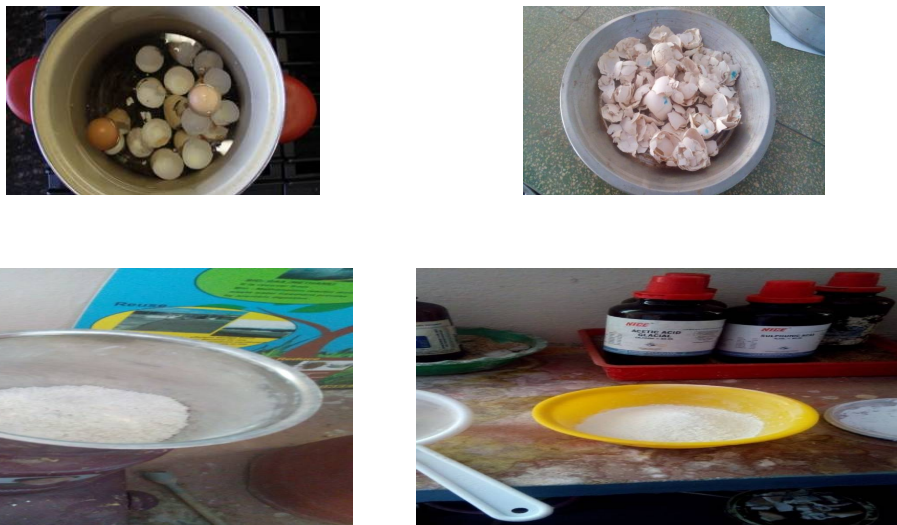
Fig 1 - Processing of eggshell waste